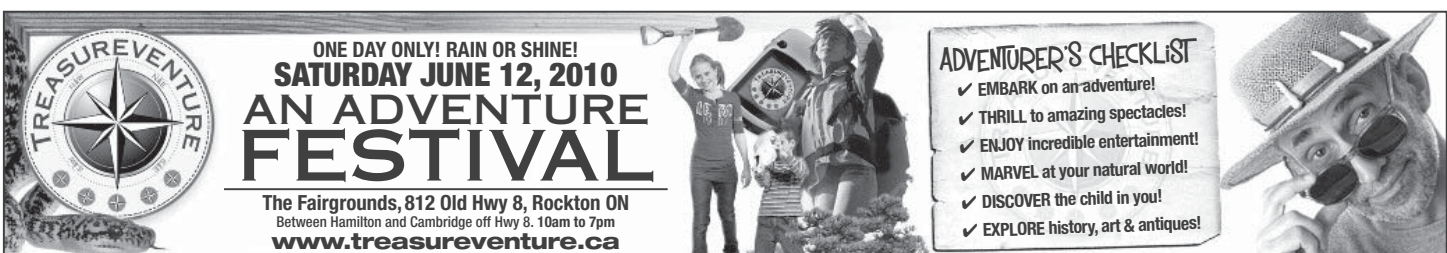
Cambridge Times Community Newspaper – 1/8 Pg.