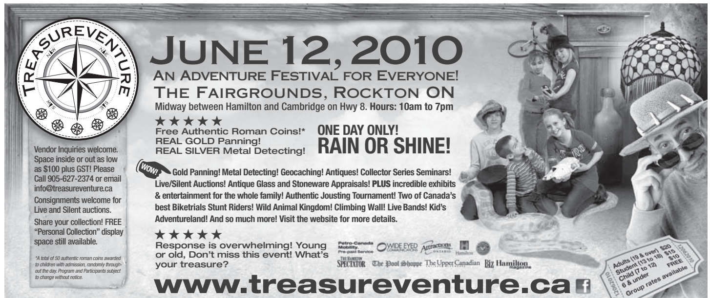
Wayback Times Magazine – 1/4 Pg.