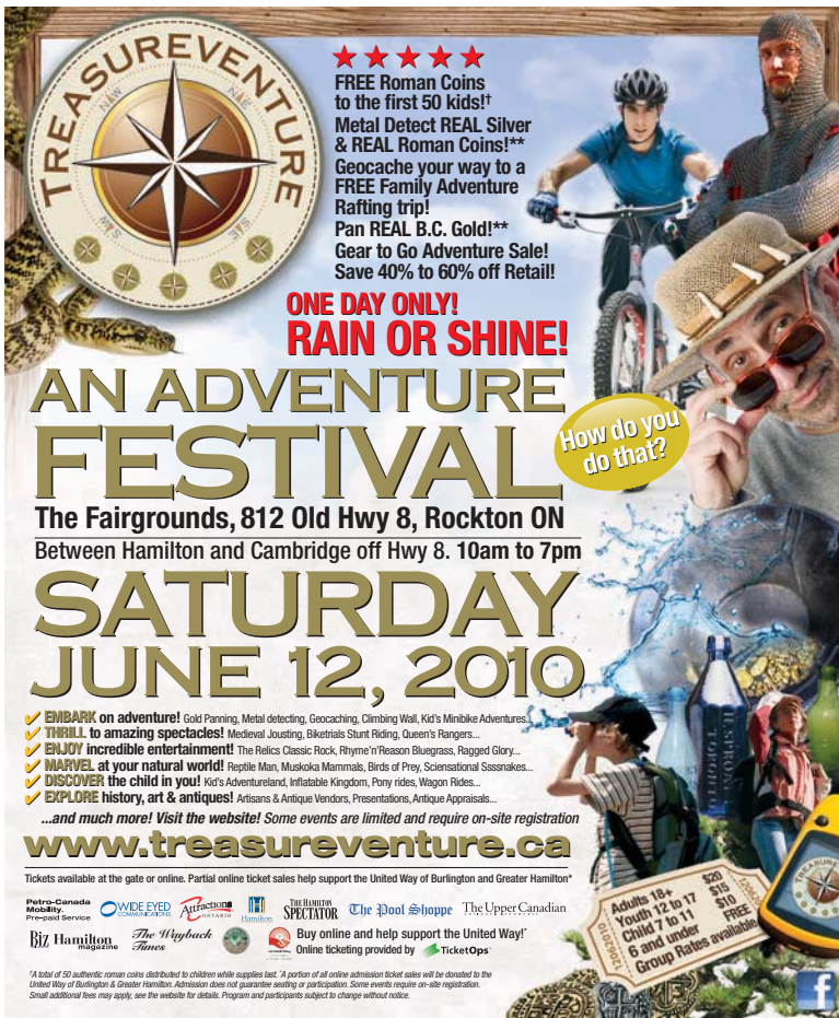
Flamborough Review Community Newspaper – Full Pg.