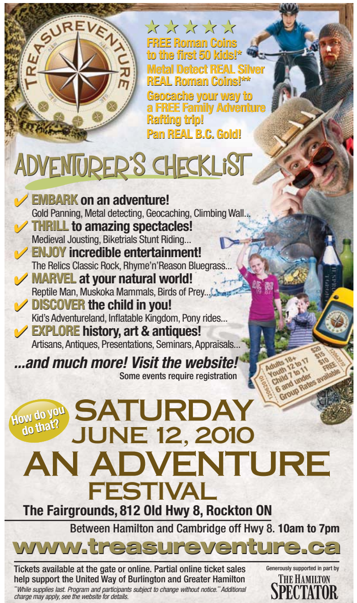
Hamilton Spectator – 1/6 Pg. (series of 4)