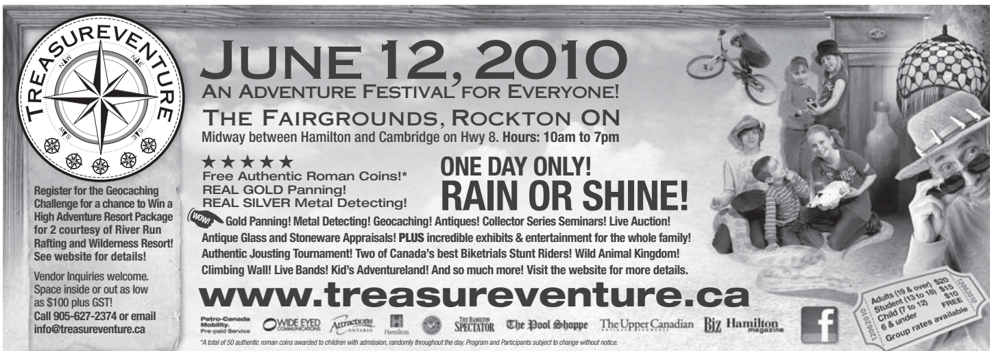
Daytripper Newspaper – 1/8 Pg.