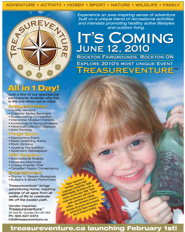
Hamilton Recreation Guide – Full Pg.