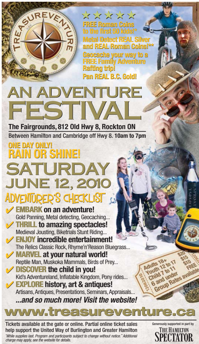
Hamilton Spectator – 1/6 Pg. (series of 4)